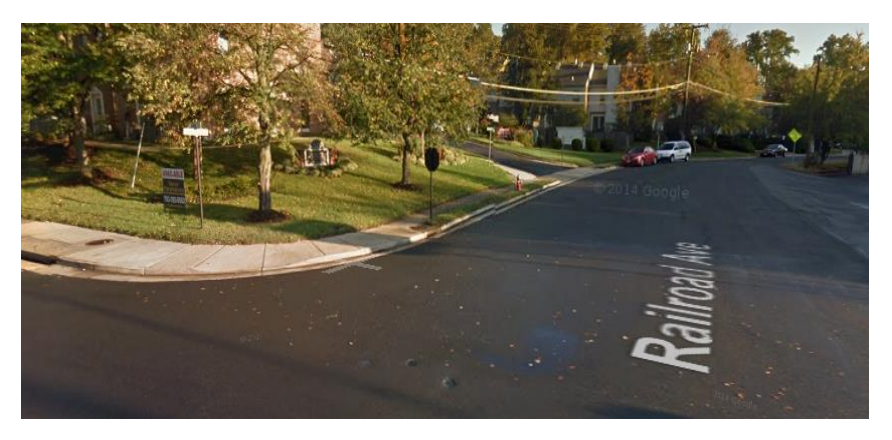
← PNC Bank at Judicial ← Railroad Avenue from Main Street

This is the immediate left into Railroad Square