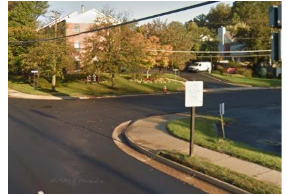
\rightarrow Freedom Bail Bonds \rightarrow